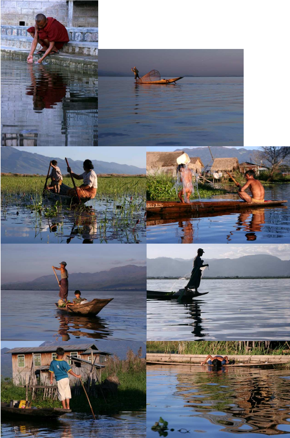
Lake Inle, in Burma. People living on piles, with a high dependence on clean, drinkable water. Everyday life scenes of fishing, washing, hygiene.