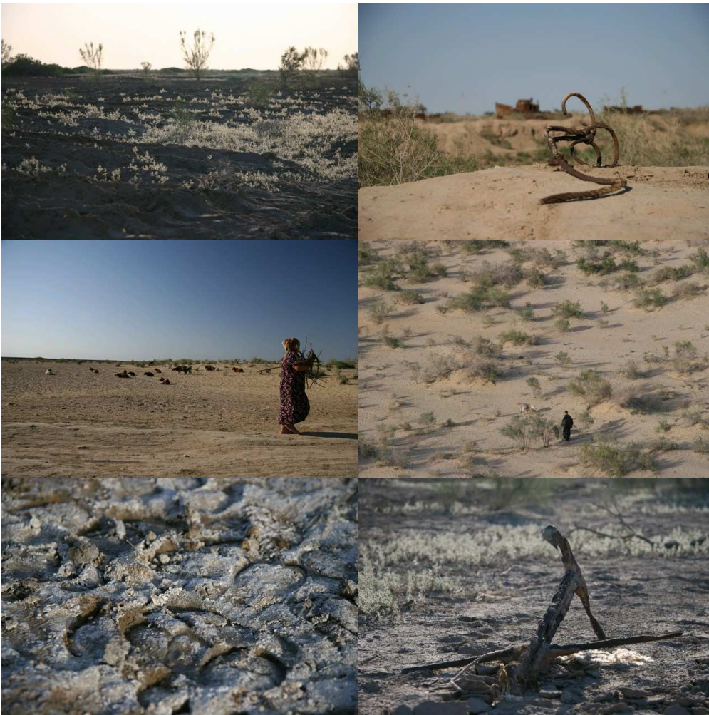
Remains of ships. Woman picking up firewood. Man and his goat in the wide ocean. Cattle prints in the salty ground. Anchor remaining there.